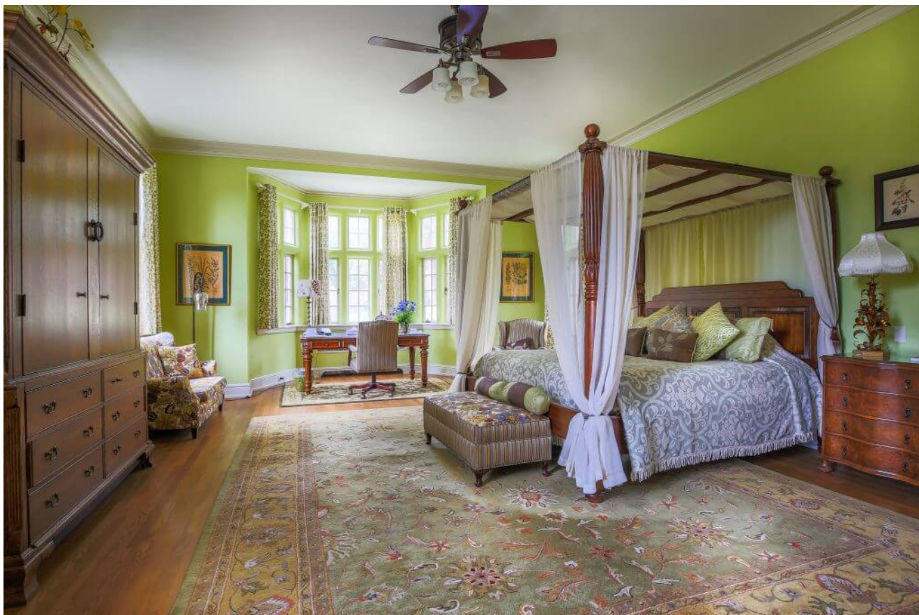
The Pink House

Spend the night in our historic lodges. Each lodge has it's own charm and character, with newly renovated furnishings, warm comfort, meeting spaces and more!